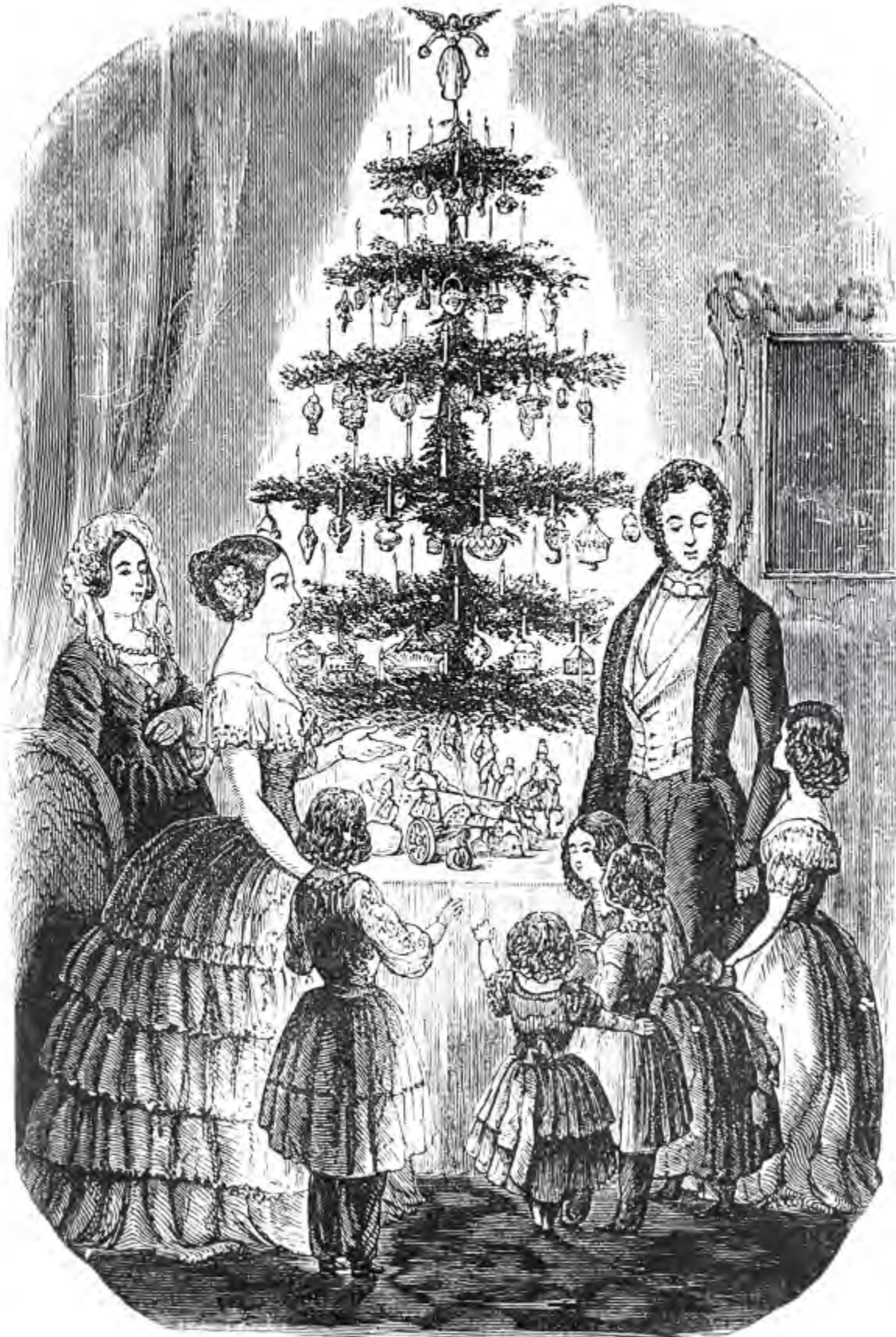
THE CHRISTMAS TREE.