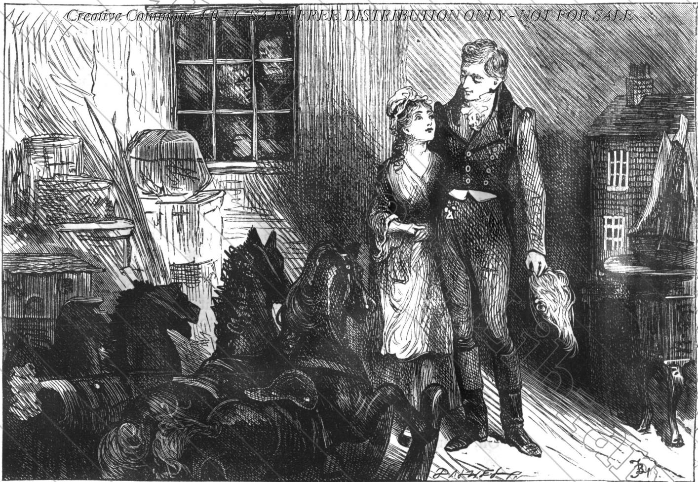
"SUFFERING HIM TO CLASP HER TO HIS BOWELS AND KISS HER FULLY DOWN THE DIM WOODEN GALLERY."

Creative Commons 4.0 BY SA BY FREE DISTRIBUTION ONLY - NOT FOR SALE