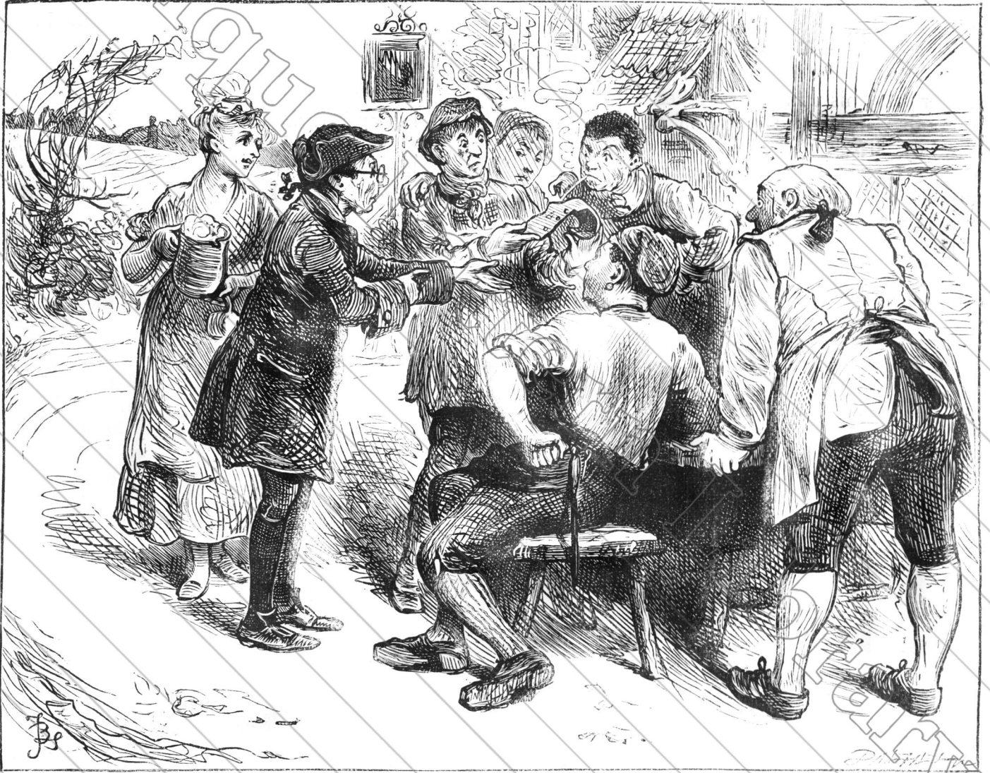
THE BATTLE OF LIFE. www.antiquepatternlibrary.org 2018.11 A LOVE STORY