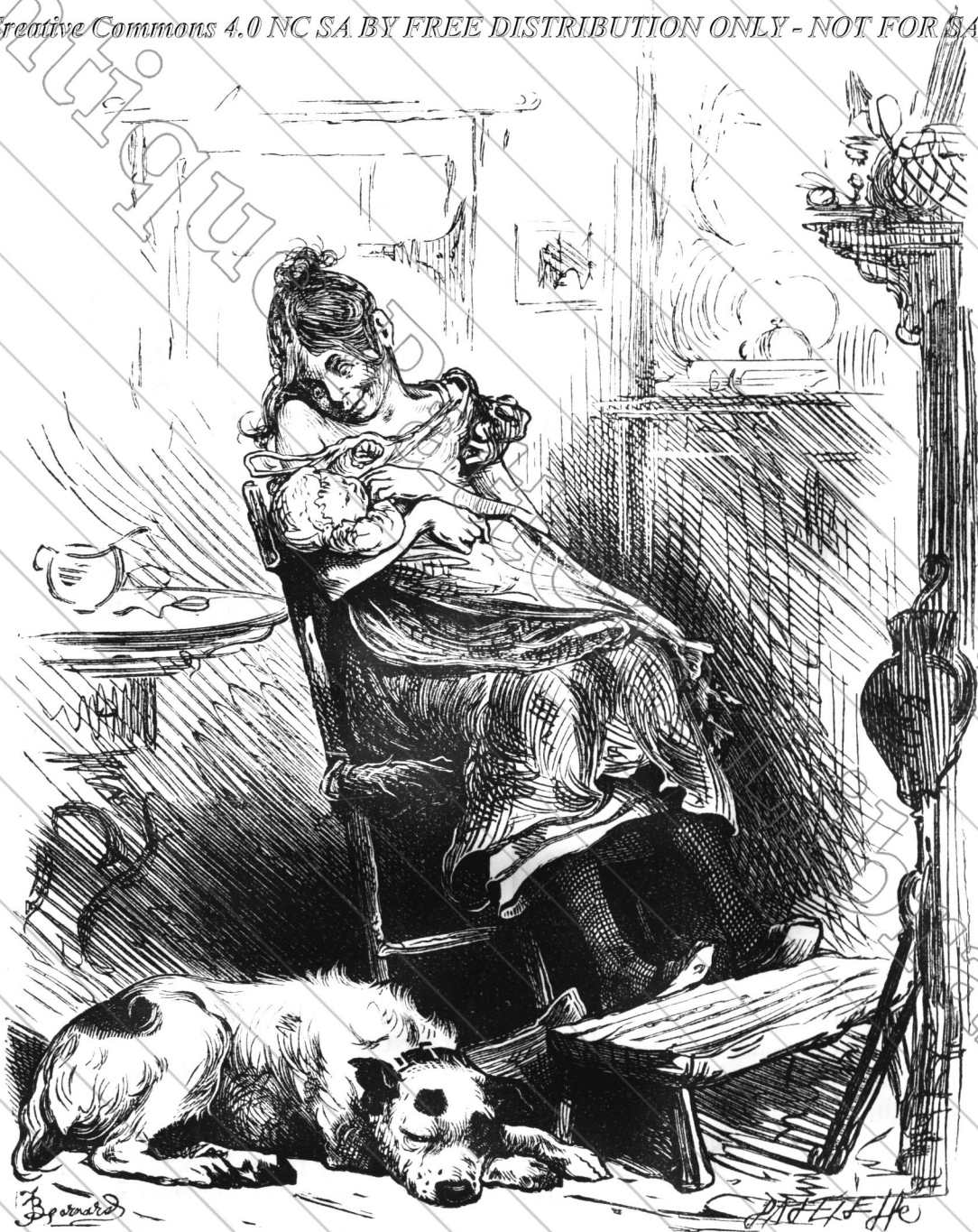
“DID ITS MOTHERS MAKE IT UP A BEDS, THEN!” CRIED MISS SLOWBOY TO THE BABY; “AND DID ITS HAIR GROW BROWN AND CURLY WHEN ITS CATS WAS LIFTED OFF, AND FRIGHTEN IT, A PRECIOUS PETS, A SITTING BY THE FIRES!”