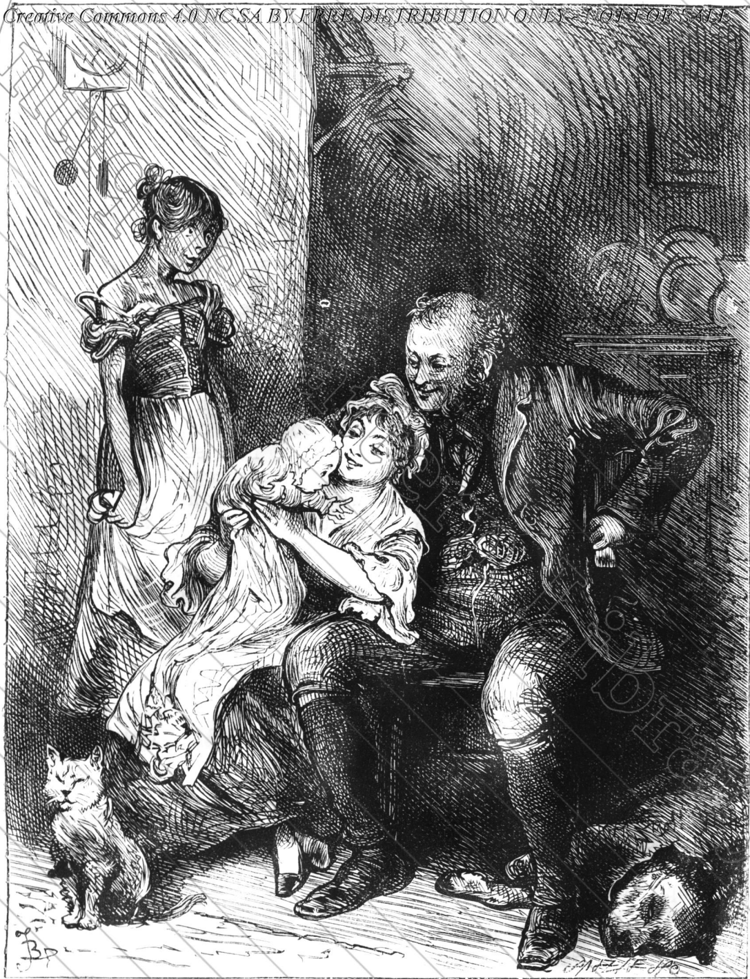
THE CRICKET ON THE HEARTH.