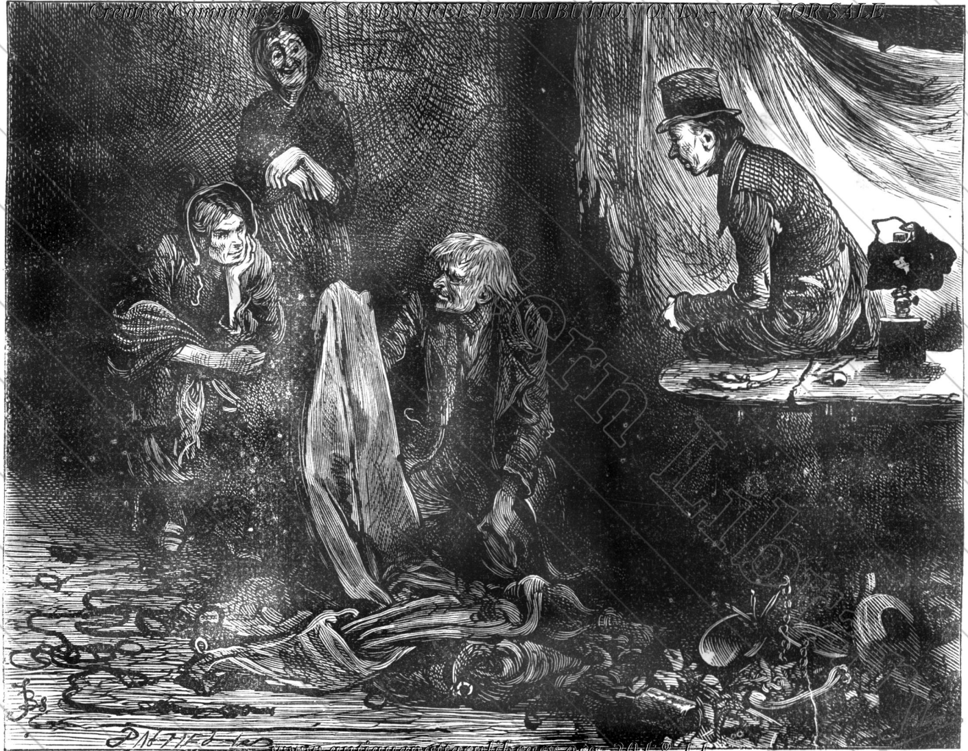
www.antiquepatternlibrary.org 2018.11 "WHAT DO YOU CALL THIS?" SAID JOE. "BED-CURTAINS?"

Crane Company 2007. ALL RIGHTS RESERVED. DISTRIBUTION BY DAWSON FOR SALE