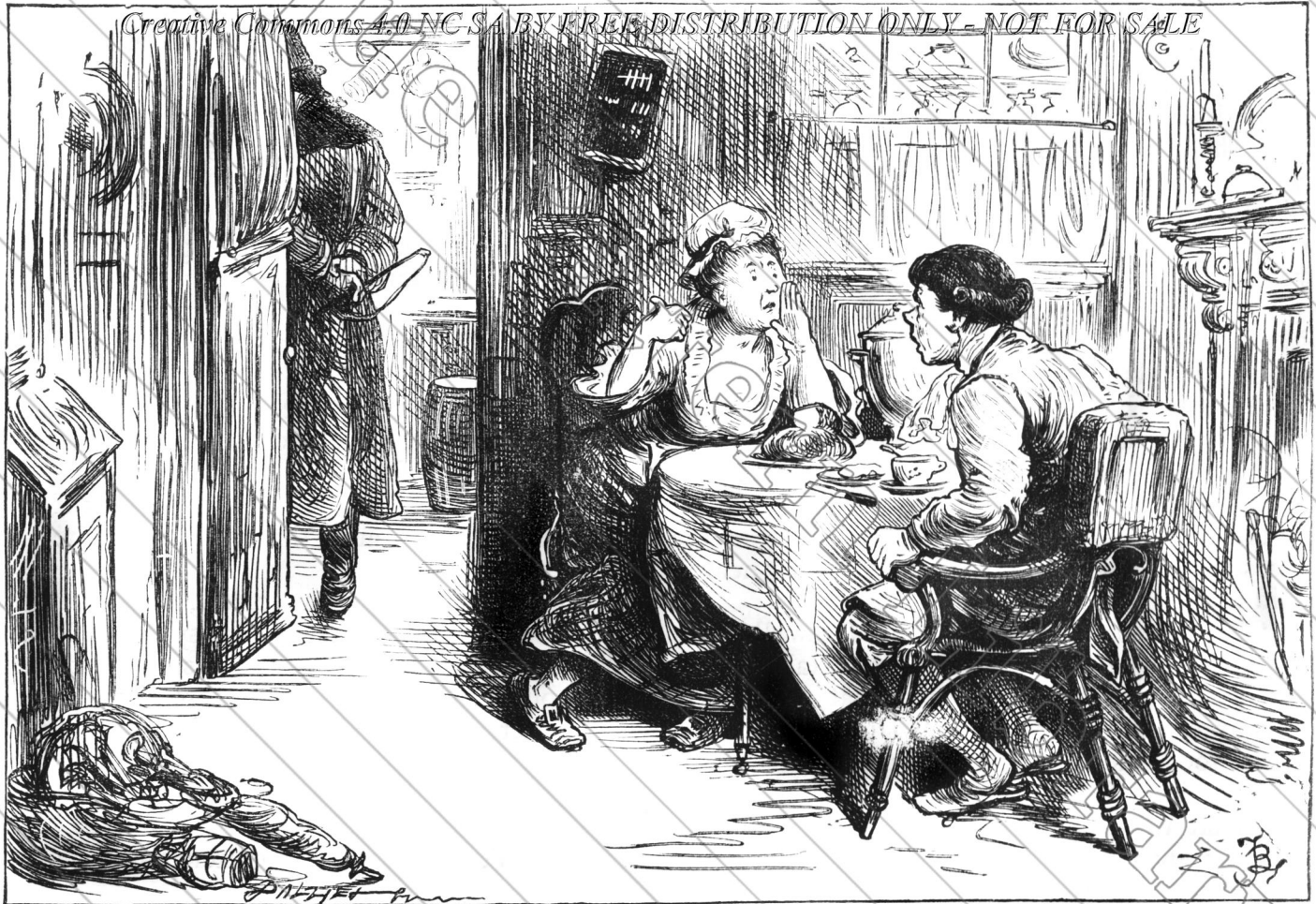
“GUESSED HALF ALOUD ‘MILK AND ANTIQUE PATTERNS LIBRARY,’ 2018. A1 APPROACH HER MEANING.”