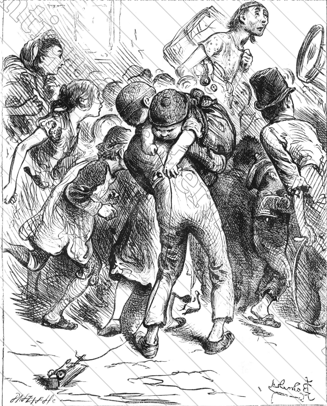
“IT ROVED FROM DOOR-STEP TO DOOR-STEP, IN THE ARMS OF SLITTLE, JOHNNY TETTERBY, AND LAGGED HEAVILY AT THE REAR OF TROOPS OF JUVENILES WHO FOLLOWED THE TUMBLERS,” ETC.