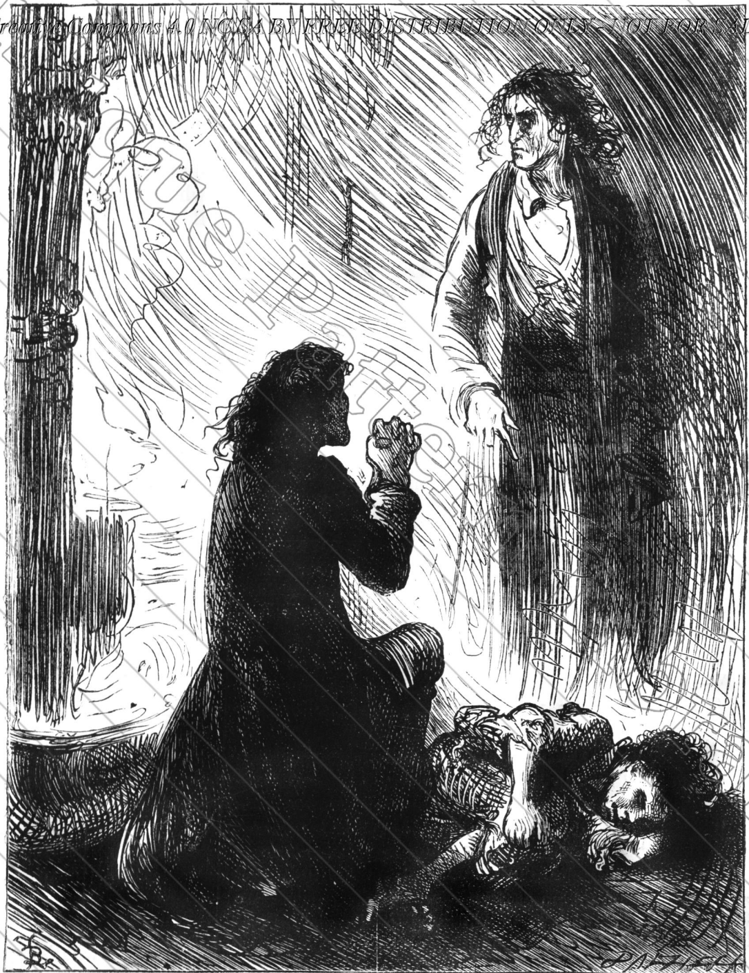
"YOU SPEAK TO ME OF WHAT IS LYING HERE, THE PHANTOM INTERPOSED, AND POINTED WITH ITS FINGER TO THE BOY."