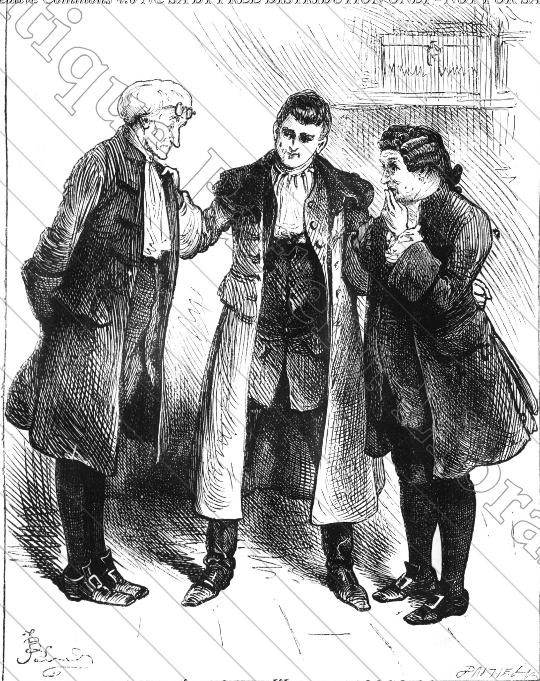
www.antiquepatternlibrary.org 2018.11 “I THINK IT WILL BE BETTER NOT TO HEAR THIS, MR. CRAGGS?” SAID SNITCHEY, LOOKING AT HIM ACROSS THE CLIENT.—“I THINK NOT,” SAID CRAGGS,—BOTH LISTENING ATTENTIVELY.