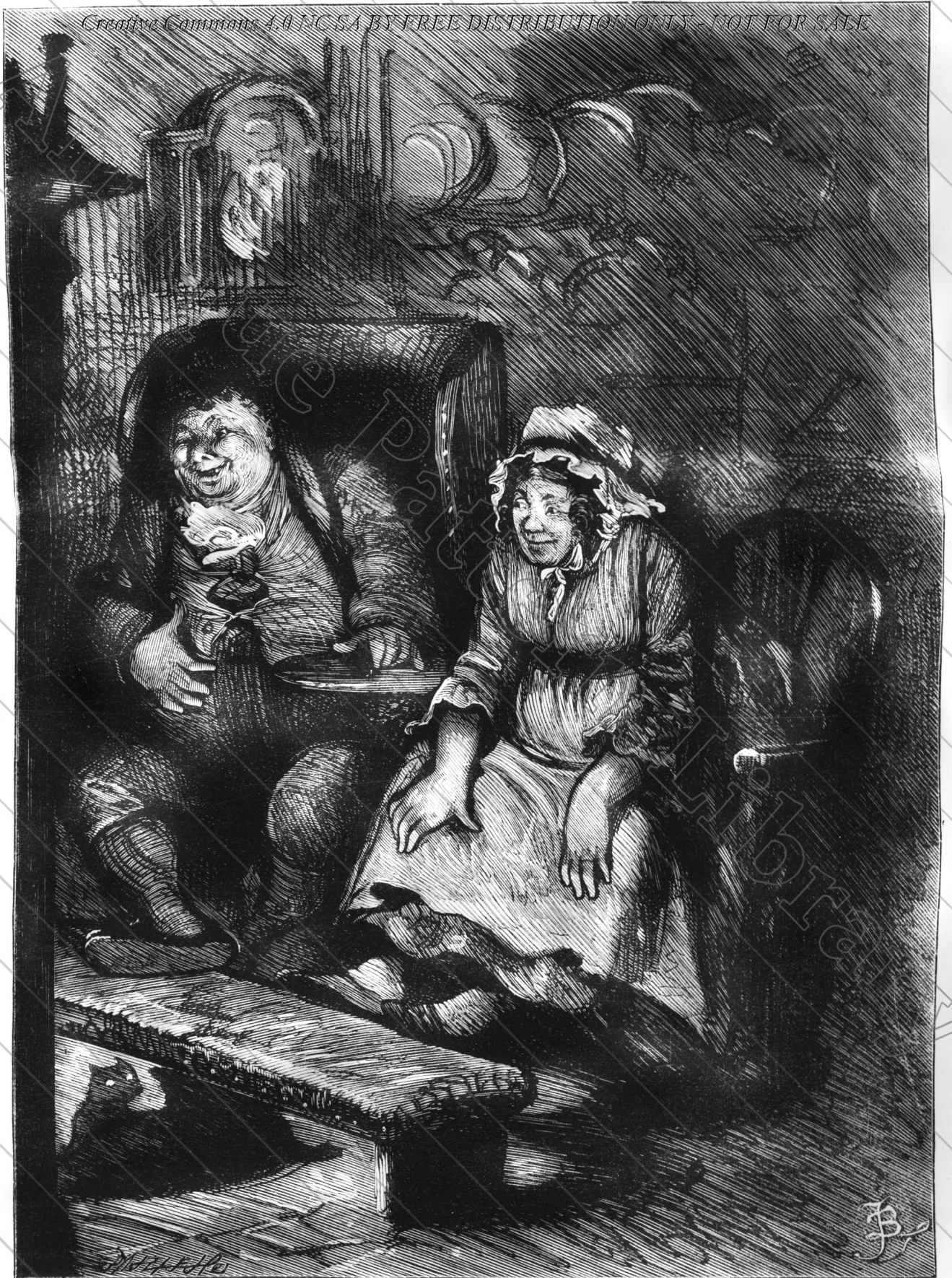
"YOU'RE IN SPIRITS, TUGBY," SAID TUGBY. "NO," SAID TUGBY. "NO. NOT PARTICULAR. I'M A LITTLE ELEWATED. THE MUFFINS CAME SO PAT!"—P. 69