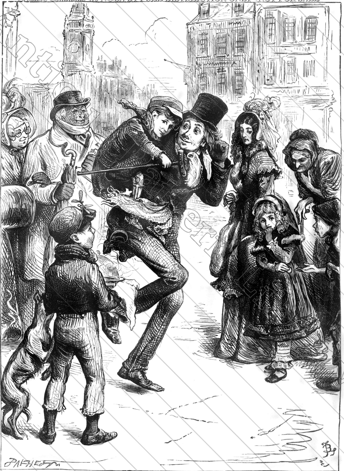
"HE HAD BEEN TIM'S BLOOD-HORSE, ALL THE WAY FROM CHURCH, AND HAD COME HOME RAMPANT. —Christmas Carol, P. 21