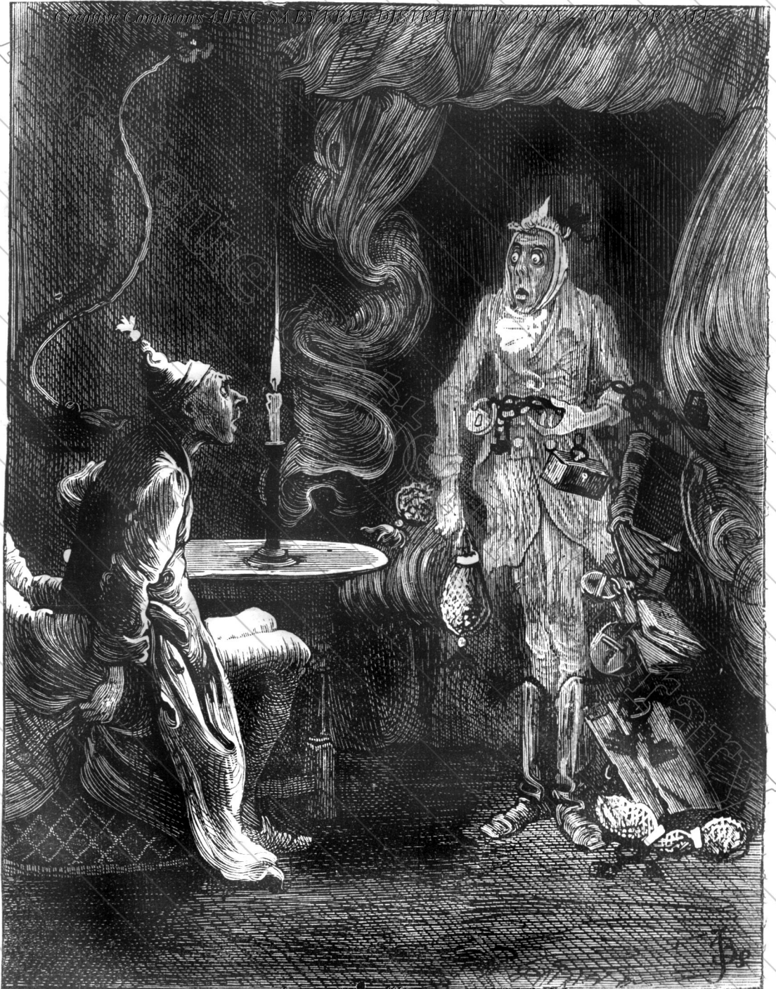
www.antiquepatternlibrary.org 2018.11 MARLEY'S GHOST.