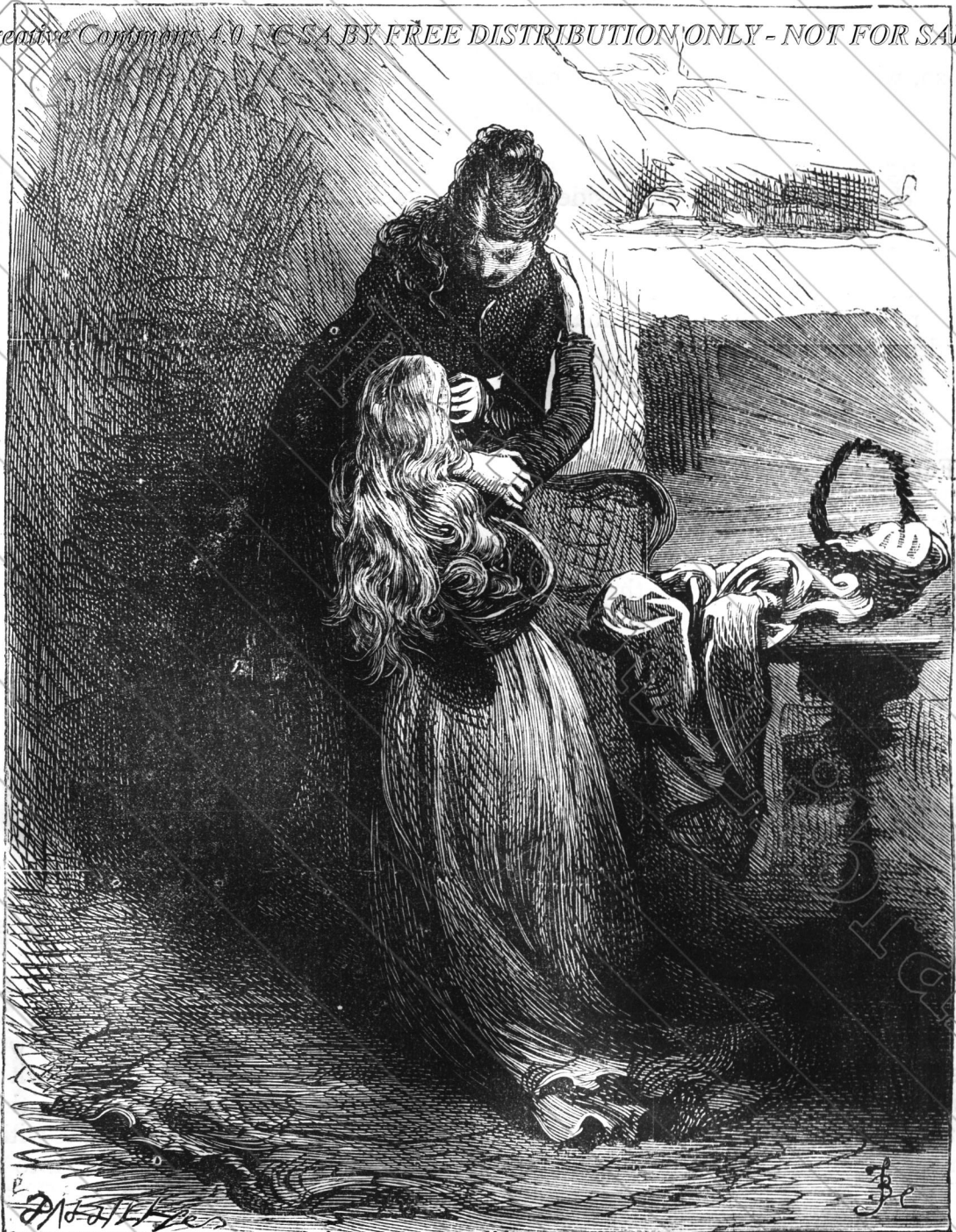
“NEVER MORE, MEG; NEVER MORE! HERE! HERE! CLOSE TO YOU, HOLDING TO YOU, FEELING YOUR DEAR BREATH UPON MY FACE!”