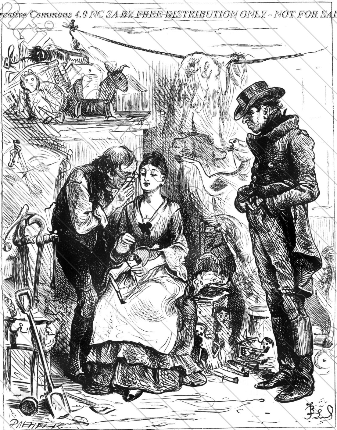
"THE EXTENT TO WHICH HE'S WINNING AT THIS MOMENT," WHISPERS LOCALEB TO HIS DAUGHTER. "OH, MY GRACIOUS!"