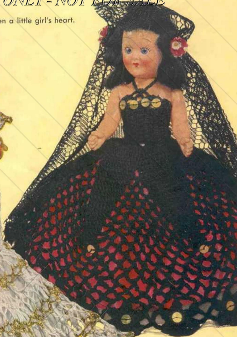
Gay Senorita S-178 Directions on page 5