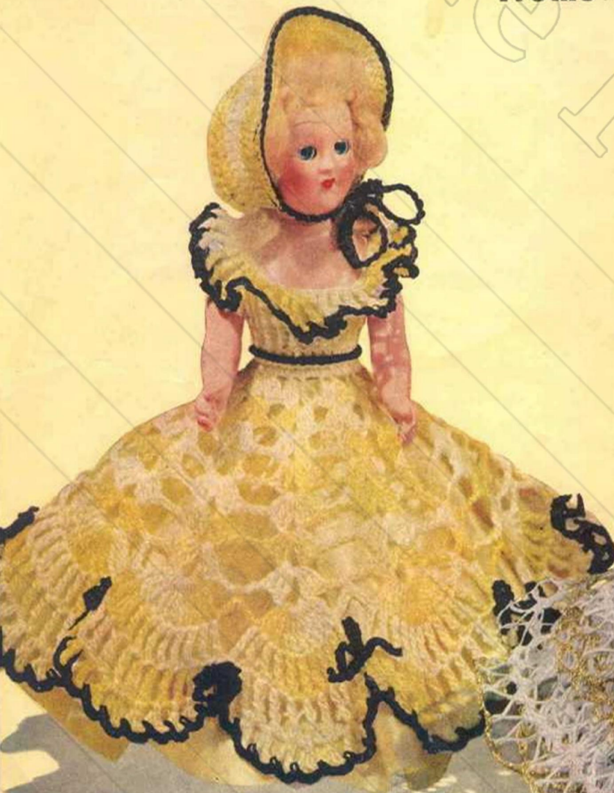
Shepherdess S-177 Directions on page 4

Items . . . to grace any room in your house, or to gladden a little girl's heart.