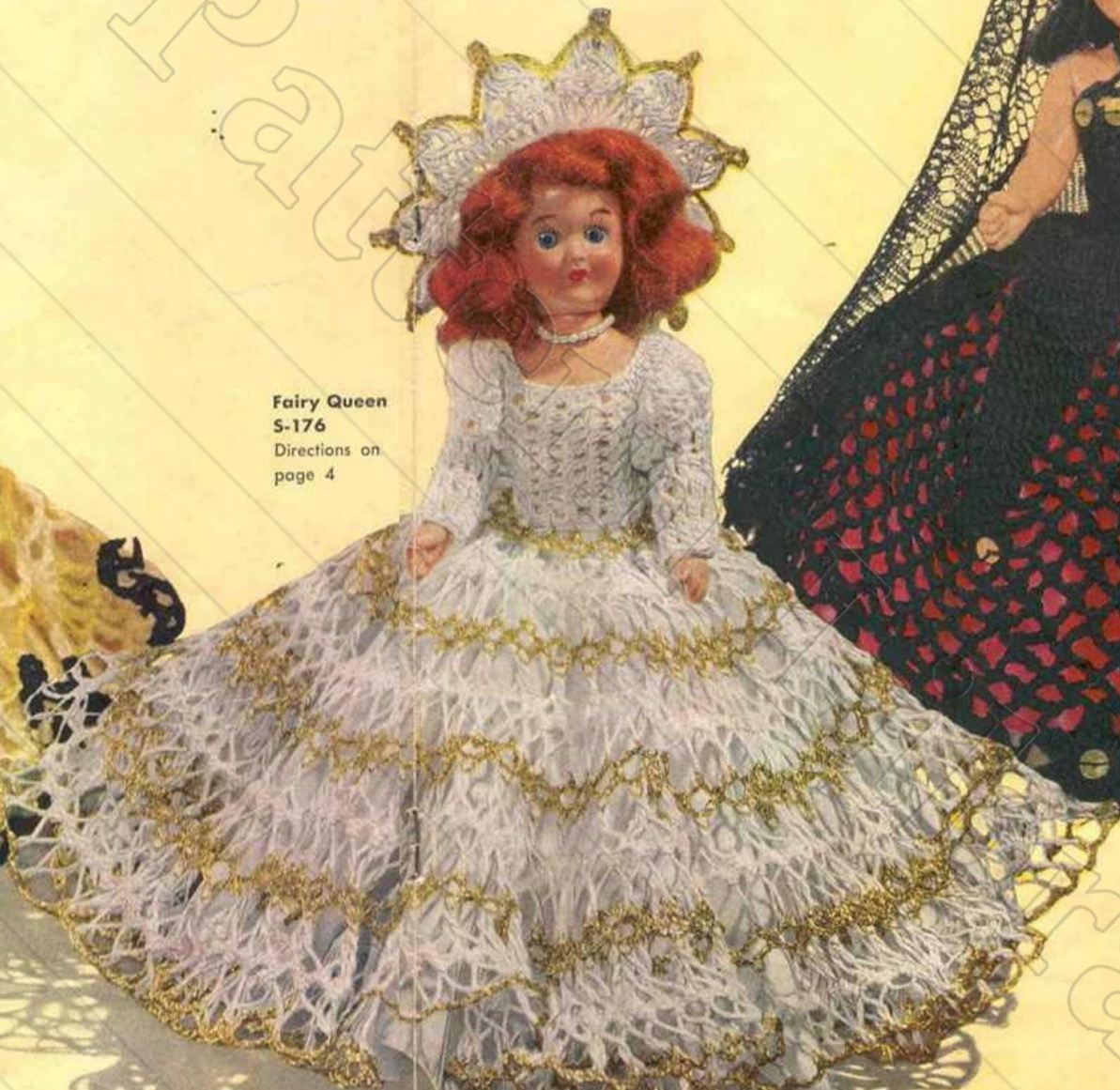
Fairy Queen S-176 Directions on page 4