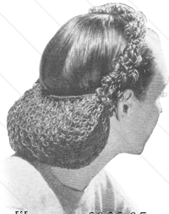
#3514 Instructions on page 22