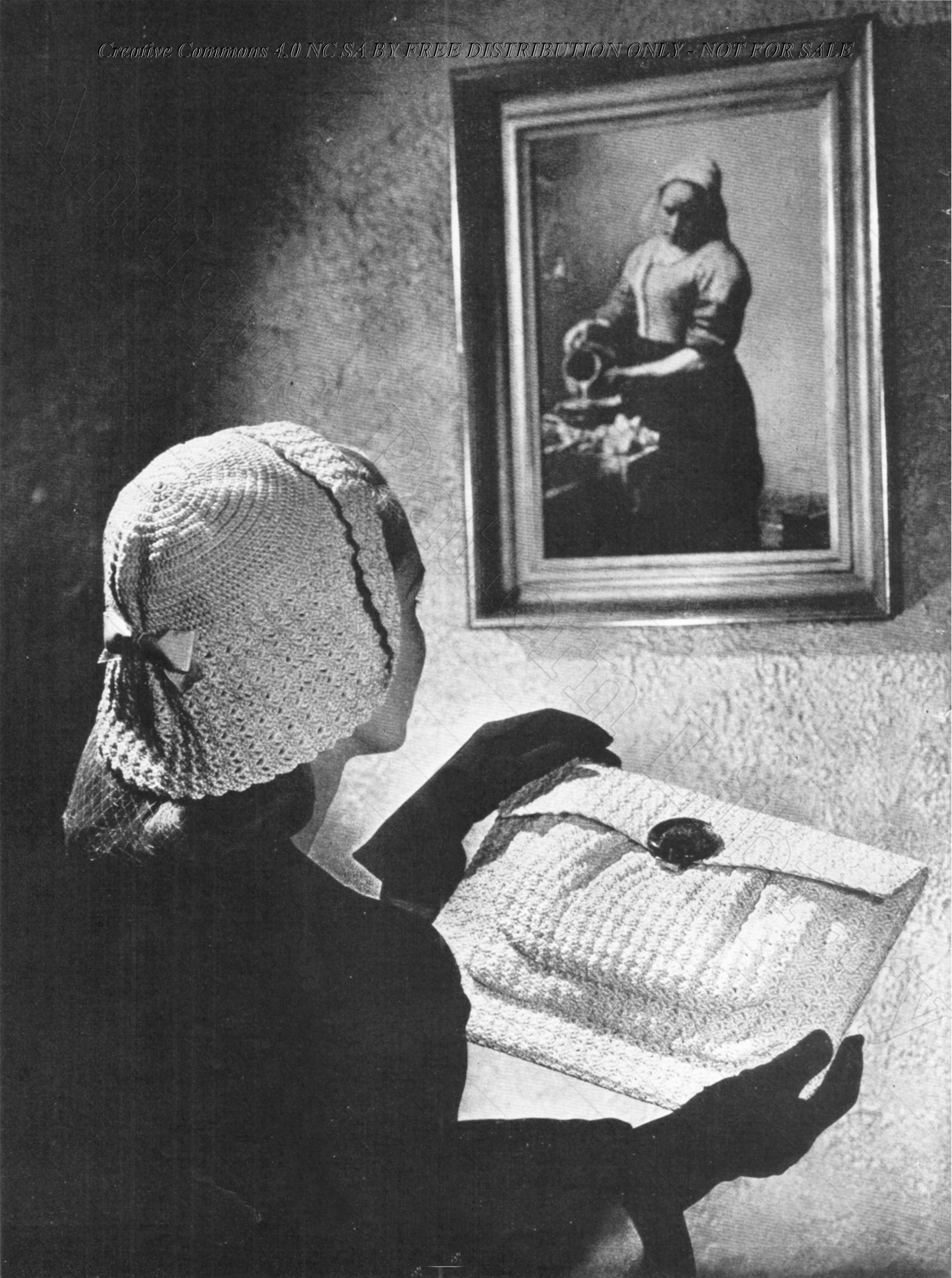
No. 3504 — Flemish Drape after Vermeer's "Milkmaid".