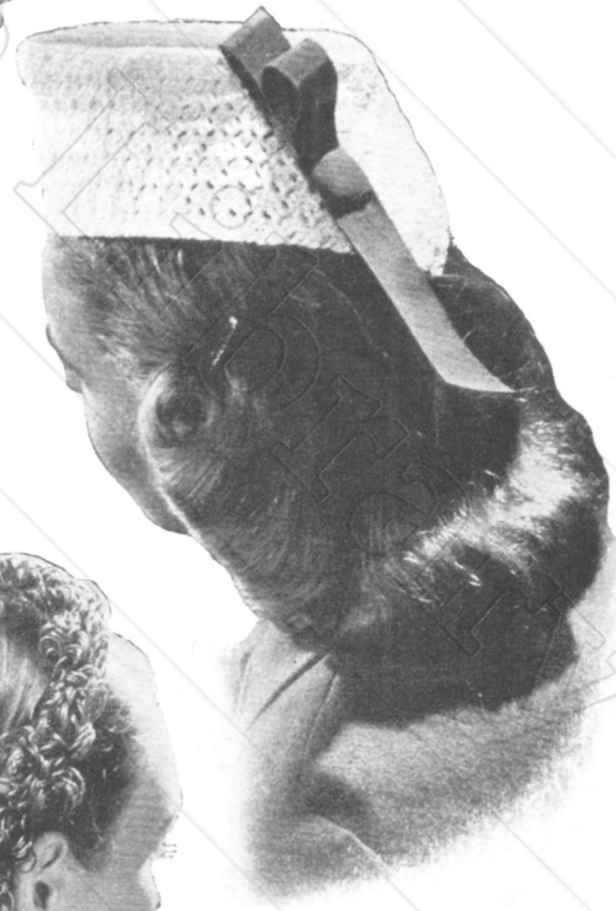
#3513 Instructions on page 4