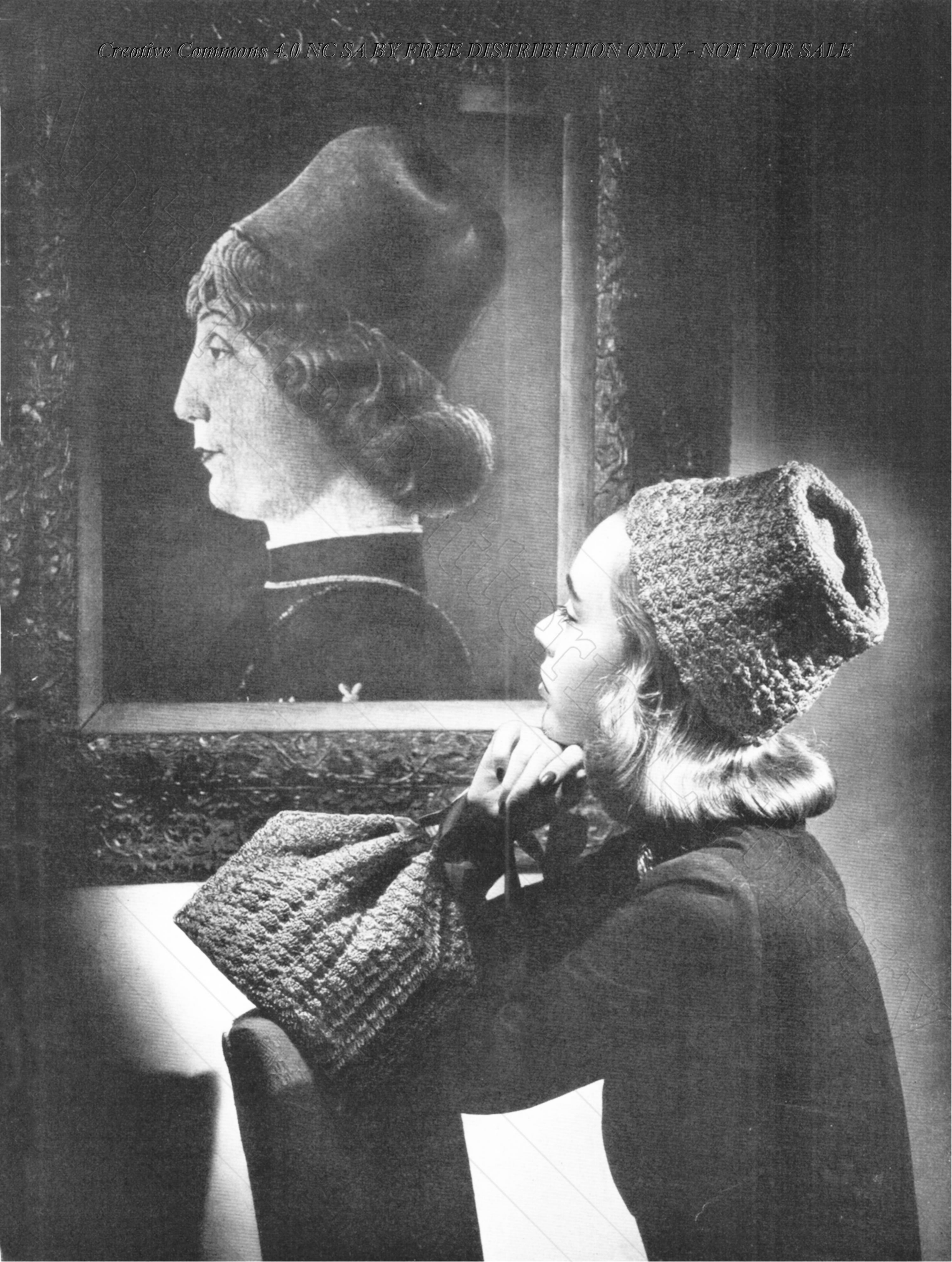
No. 3502— from www.antiqunatternlibrary.com "A Member of the D'Este Family".