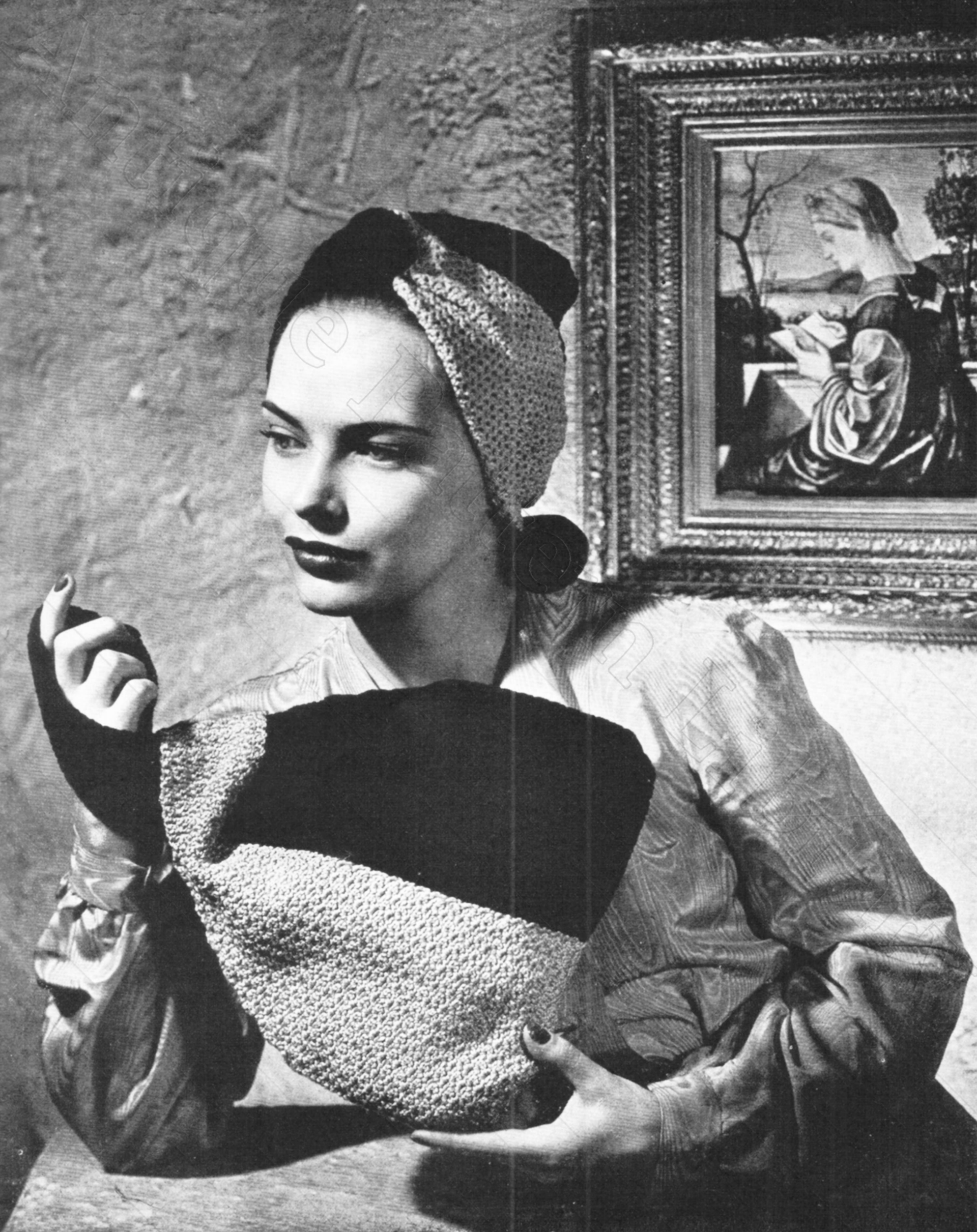
No. 3518 — Hal inspired by Vittore Caracciolo's "Woman Reading" . www.antiqnepatternlibrary.org 2021/07