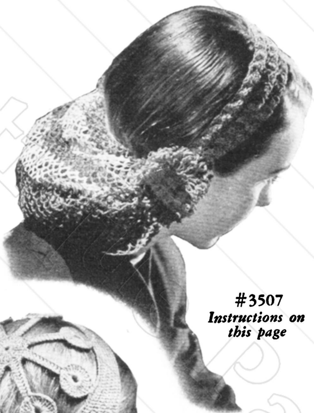
#3507 Instructions on this page