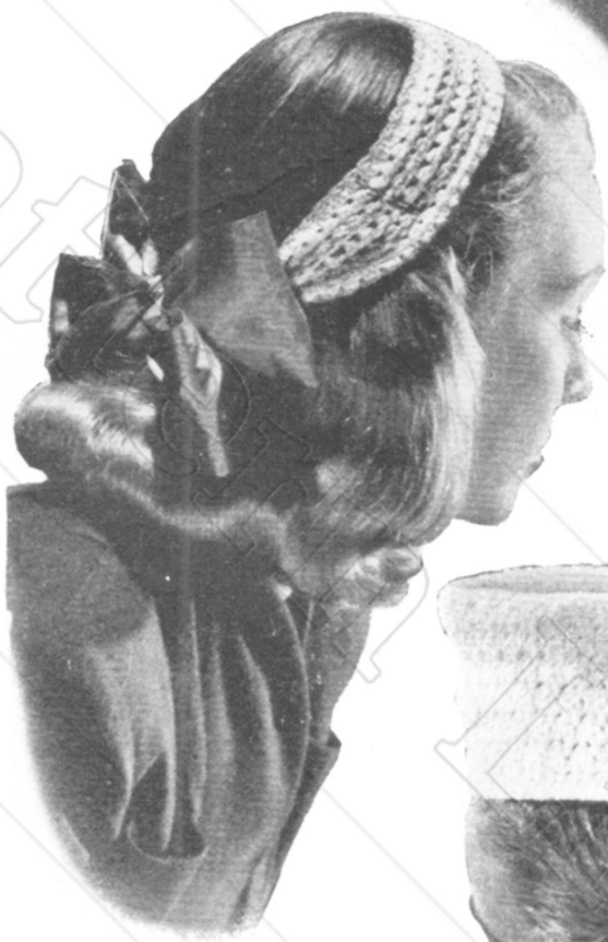
#3512 Instructions on this page