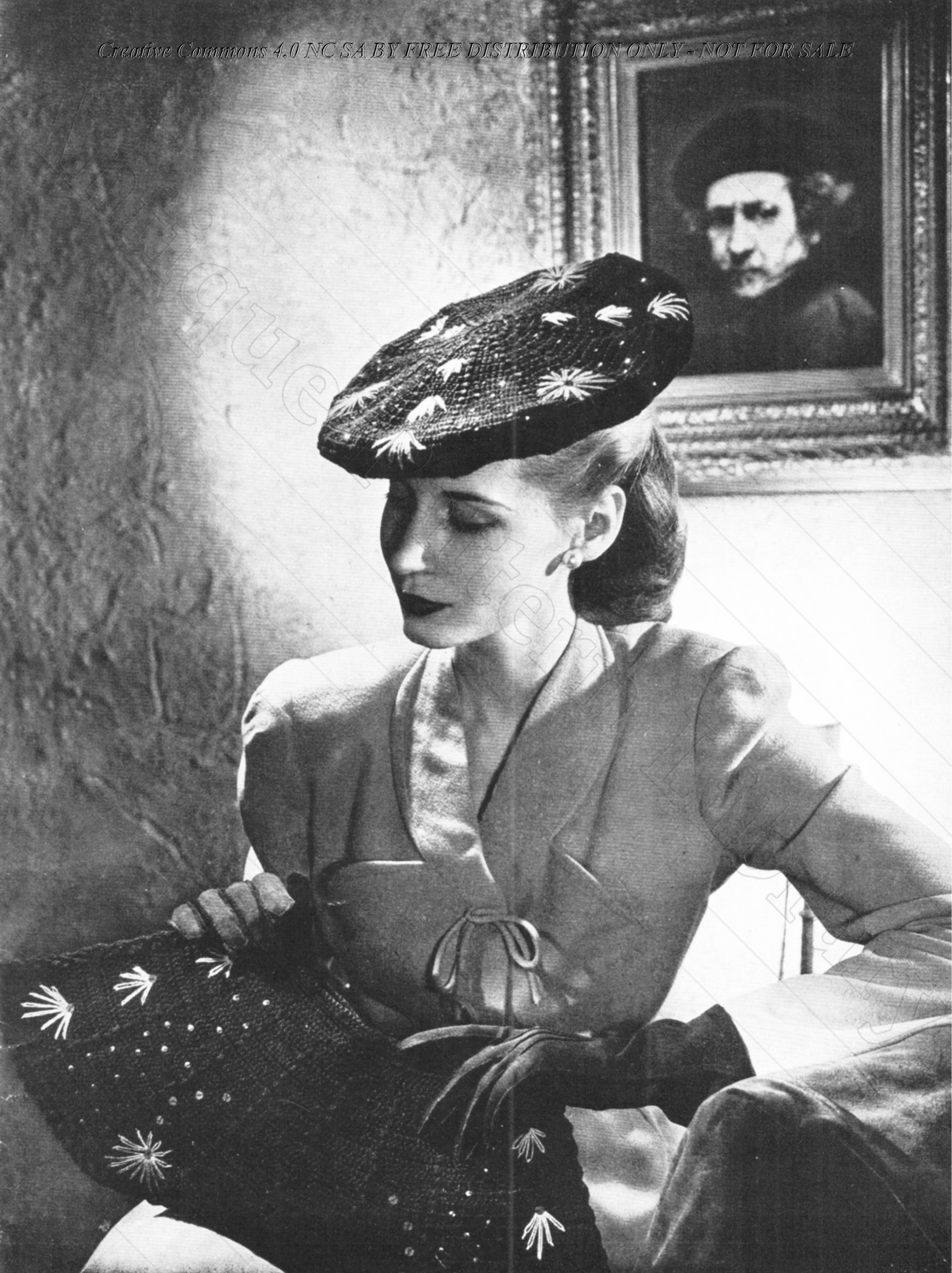
No. 3505 — www.antiqunepatternlibrary.org 2022/07 A Rembrandt Beret from his self-portrait.