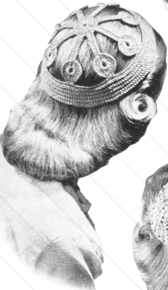
#3508 Instructions on this page