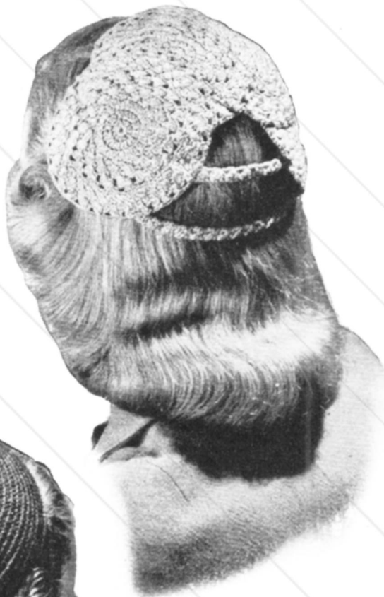
#3509 See page 13 for instructions