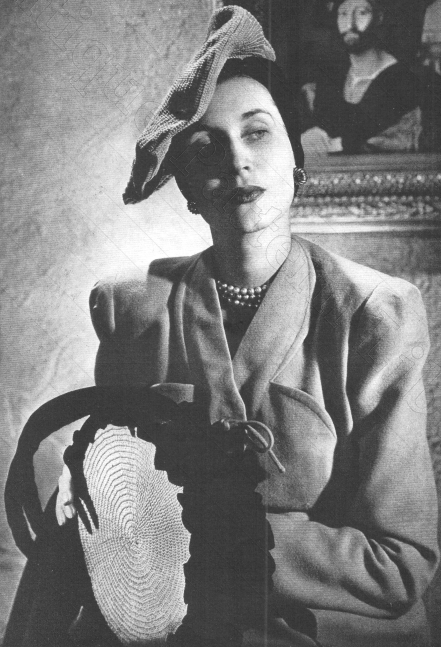
No. 3516 — Turban Beret after Raphael Sanzio's "Giuliano D'Medici".