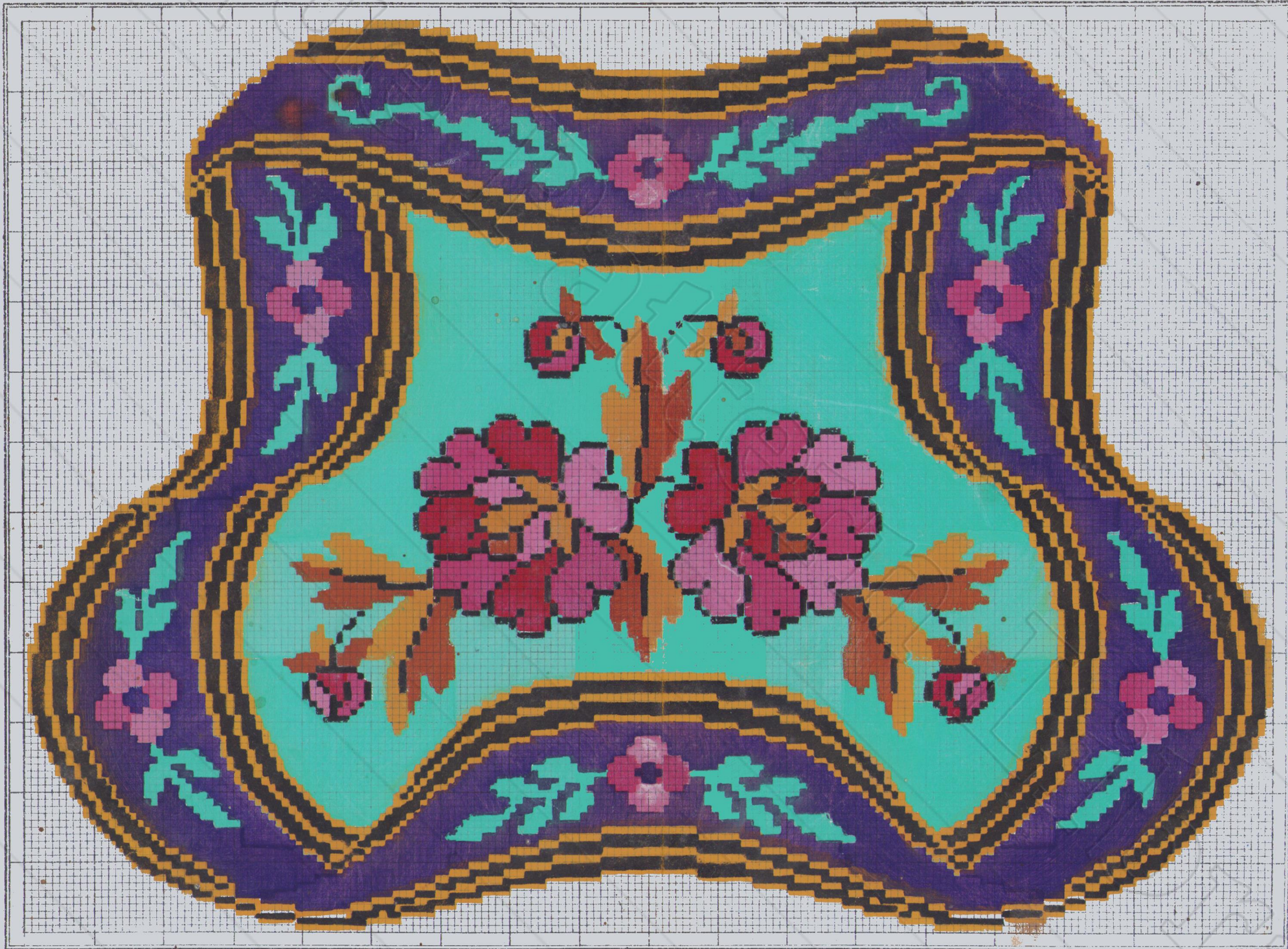
Dessin de M me FIGUIER, rue de Navarin, N o 2, Paris